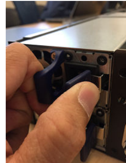
FIGURE 2 Unlocking the PSU